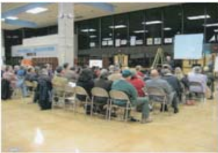
Public Workshop Meeting #4

The EIR identified feasible mitigation measures and alternatives that would avoid or reduce significant impacts. The Draft EIR discloses the possible environmental impacts associated with the implementation of the Park Plan and proposes mitigation measures to reduce these impacts to a less than significant level. With the exception of one of the projects impacts related to Climate Change, all impacts identified for the implementation of the Park Plan would be mitigated to a less than significant level with the implementation of mitigation measures in the EIR.